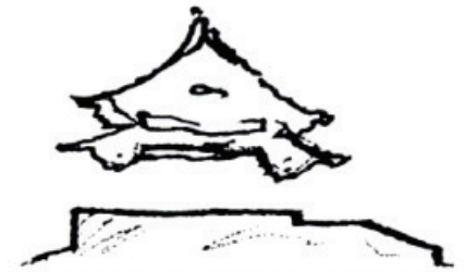
Roof and platform in Chinese architecture. Sketch by Jørn Utzon.