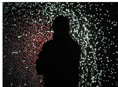
AstroVis is a visualization of a red and a white dwarf star interacting with each other